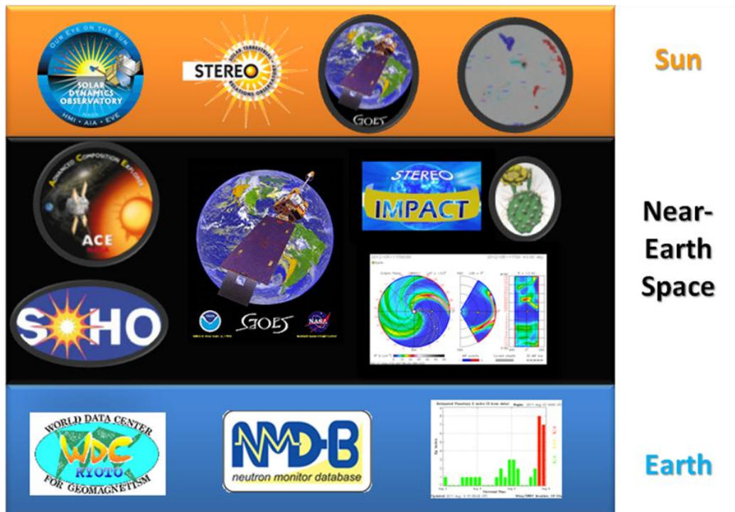
Figure 1. A subset of the available recordings that are being used for the forecasting of geomagnetic conditions in near Earth space. From top to bottom: the solar recordings of SFs, CMEs and CHs by SDO, STEREO and GOES; IP recordings from SOHO, ACE. GOES, STEREO, together with prediction models as the iSWA and Cactus; and measurements derived at Earth, i.e. Dst index (nT), neutron monitor data and Kp index.

Human forecasters routinely estimate the A_p index with a set of rules that include a number of known parameters/properties of A_p index, as well as current observations of the Sun and near-Earth space.