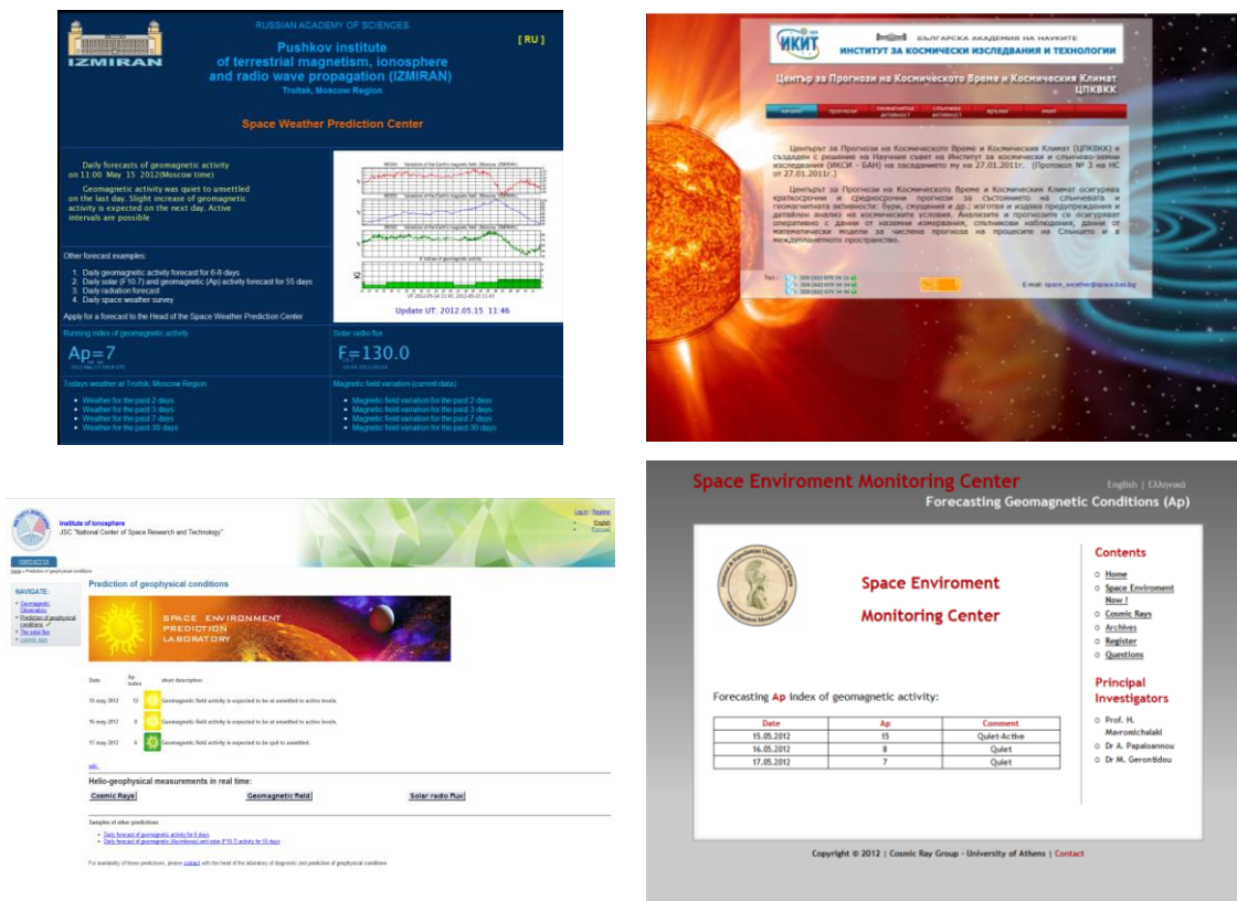
Figure 3: The websites of the operational Space Weather Prediction Centers, IZMIRAN ( http://forecast.izmiran.rssi.ru/indexE.htm ) displayed in the top left corner, the Institute for Space Research & Technology of the Bulgarian Academy of Sciences in the top right corner ( http://www.space.bas.bg/SpaceWeather/ ), the Kazakhstan Institute of Ionosphere in the bottom left corner ( http://www.ionos.kz/?q=en/node/21 ) and the National & Kapodistrian University of Athens in the bottom right corner ( http://spaceweather.phys.uoa.gr )